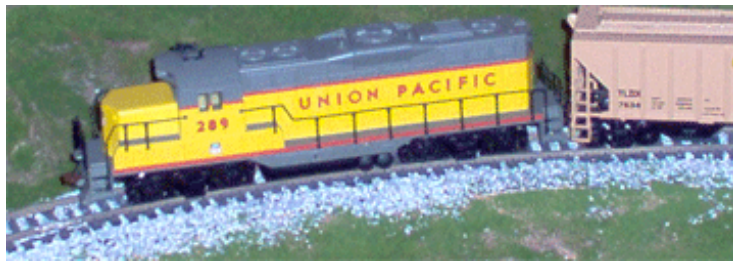
My train set...a work in progress

Nothings as rich as the salt of the earth. Don't let the holes in my pockets determine my worth.